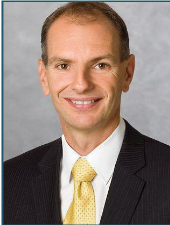
Hon. David Southwick MP